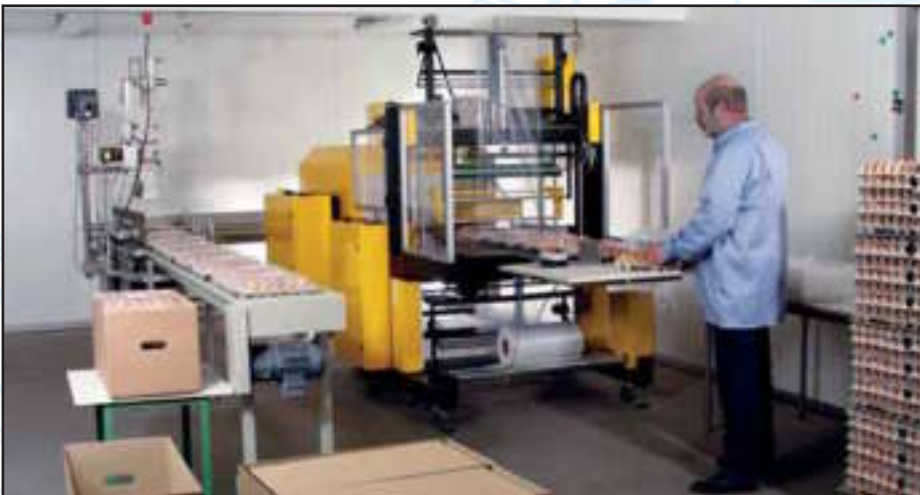
A U-shaped installation permits one-man operation in small spaces.

These machines distinguish themselves by quickly and efficiently shrink-wrapping any product imaginable. The driven feed and delivery belt of the BP-700-CVS enables this machine to be installed in a production line, thus increasing the capacity and eliminating the need for products to be lifted by personnel. This special packaging system allows you to pack products of different sizes without film changeover: small products will have smaller openings on both sides than bigger products. If the film is too narrow or too wide, feeding a different width film is only a simple operation. The film is controlled fully automatically.