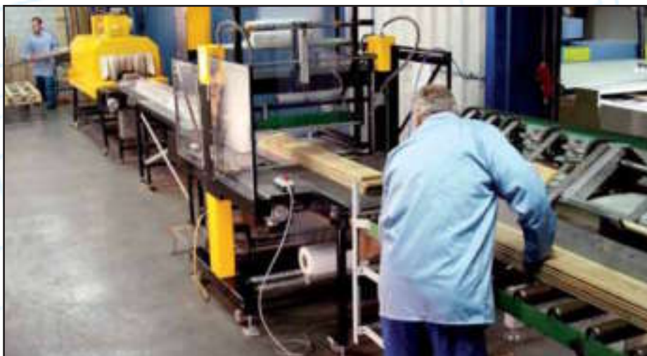
Longer products, such as parquet, require a linear installation.