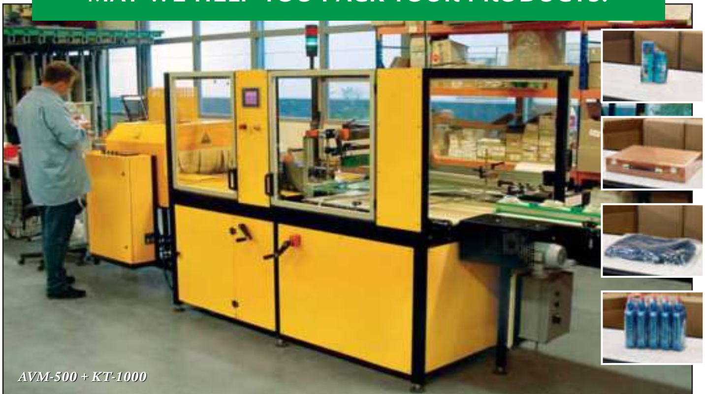
AVM-500 + KT-1000

A VC Sealing Solutions is a dynamic company with many years of experience and a clear ambition: to be the best in our market. We are well on our way to achieving that goal, although we continuously expand our know-how through research and development. When it comes to our or rather your machines, we prefer speaking in terms of solutions instead of product ranges. After all, as a specialist in sealing and shrink-film wrapping, we offer customers a complete state-of-the-art customised design to meet their specific requirements. We will manufacture a machine of the highest possible quality for each individual customer and even install the fully operational machine at the customer's site. We always provide technically sophisticated, effective, and economical packaging solutions. Our extensive experience puts us in an excellent position to assist you, preferably at an early stage, in addressing your packaging needs. A motivated team of professionals are ready to demonstrate each time that we are the best in our field and that this allows us to offer very competitive prices.