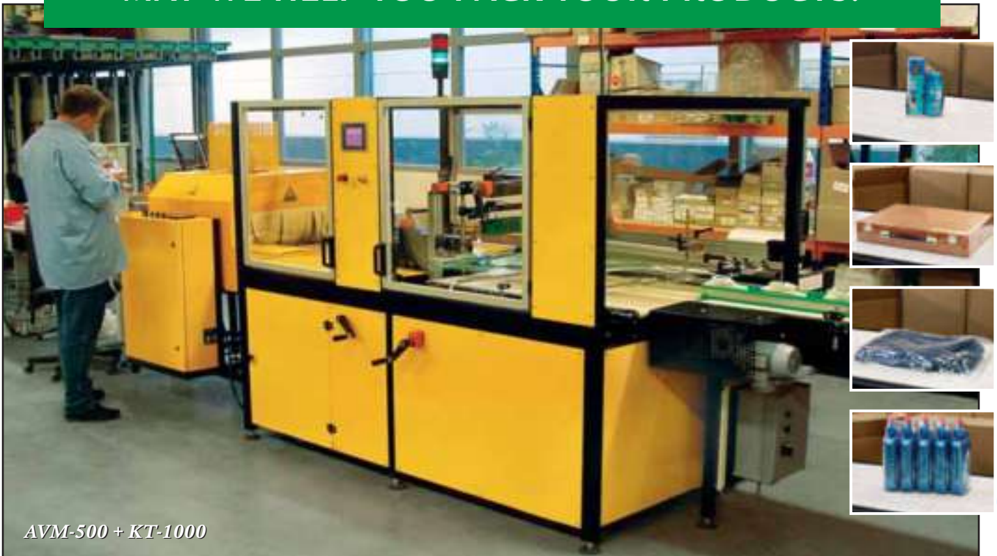
AVM-500 + KT-1000

A VC Sealing Solutions is a dynamic company with many years of experience and a clear ambition: to be the best in our market. We are well on our way to achieving that goal, although we continuously expand our know-how through research and development. When it comes to our or rather your machines, we prefer speaking in terms of solutions instead of product ranges. After all, as a specialist in sealing and shrink-film wrapping, we offer customers a complete state-of-the-art customised design to meet their specific requirements. We will manufacture a machine of the highest possible quality for each individual customer and even install the fully operational machine at the customer's site. We always provide technically sophisticated, effective, and economical packaging solutions. Our extensive experience puts us in an excellent position to assist you, preferably at an early stage, in addressing your packaging needs. A motivated team of professionals are ready to demonstrate each time that we are the best in our field and that this allows us to offer very competitive prices.